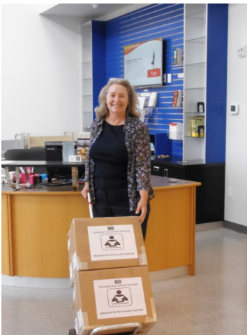
A CTLS volunteer stopped by with our Large Print Circuit books.

For more information on Bountiful Baskets and how you can participate, visit their website at www.bountifulbaskets.org .