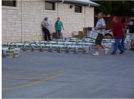
Bountiful Baskets volunteers set up the baskets for contributors.

LWPL has become the pick up point for Bountiful Baskets in the Whitney, TX area and Friday, September 19th was our first run of the program here. The program is a Co-op that pools together local contributions to give participants fresh fruits and veggies at a low cost. Some of the staff even participated in the event as contributors and they found it to be a simple and rewarding process.